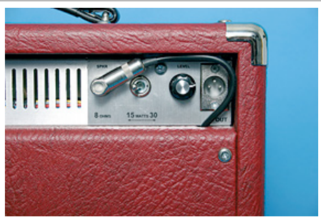
The Barnett Davies 15/30 features a built-in dummy load, a switch that selects either 15- or 30-Watt operation and a speaker-simulated DI output on XLR, accompanied by its own volume control.

Of course, there is a downside amidst my euphoria and that is simply the price. £1595 is a lot of money for a tiny combo amplifier from a small, relatively unknown British maker. In this age of Western design coupled with Chinese manufacture, £1595 is a lot of money for a 30-Watt combo amplifier of any size, from any maker. In the case of the Barnett Davies 15/30 I personally think that the investment is more than justifiable, but you're going to have to come to your own decision on that one. If you're even remotely considering purchasing an amplifier (vintage or modern) in this price range then you really need to audition a 15/30 before making your final decision — it's at the top of my list. ■■PM